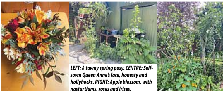
LEFT: A tawny spring posy. CENTRE: Self-sown Queen Anne's lace, honesty and hollyhocks. RIGHT: Apple blossom, with nasturtiums, roses and irises.

It was time to plant tomato seedlings and lettuces and to sow the seeds of pumpkin and beans saved from last year's crops. And there was always plenty of weeding to do. Numerous