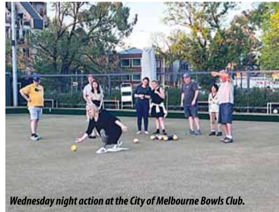
Wednesday night action at the City of Melbourne Bowls Club.