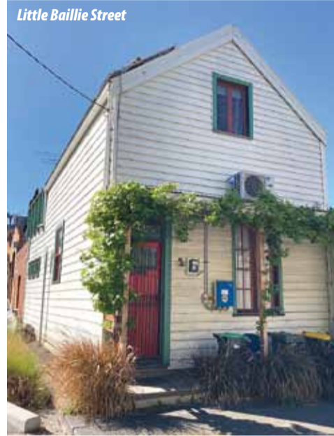
Little Baillie Street