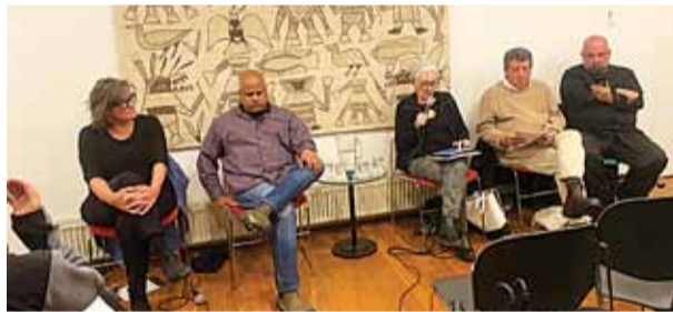
An IPCS panel leading the discussion.