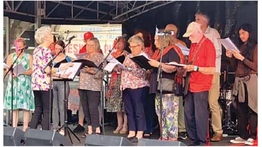
Choir in full voice at October's Queensberry Cup.

If you want to get involved in the fight to save public housing, please get in touch with me at office@ellensandell.com .