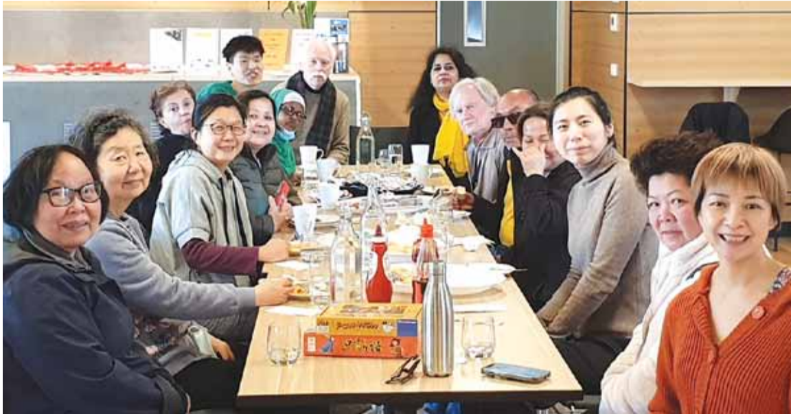
Aunties and Uncles enjoy getting together.

Our group has Aunties and Uncles from Cambodia, Vietnam, Somalia, Egypt, El Salvador, China, Taiwan