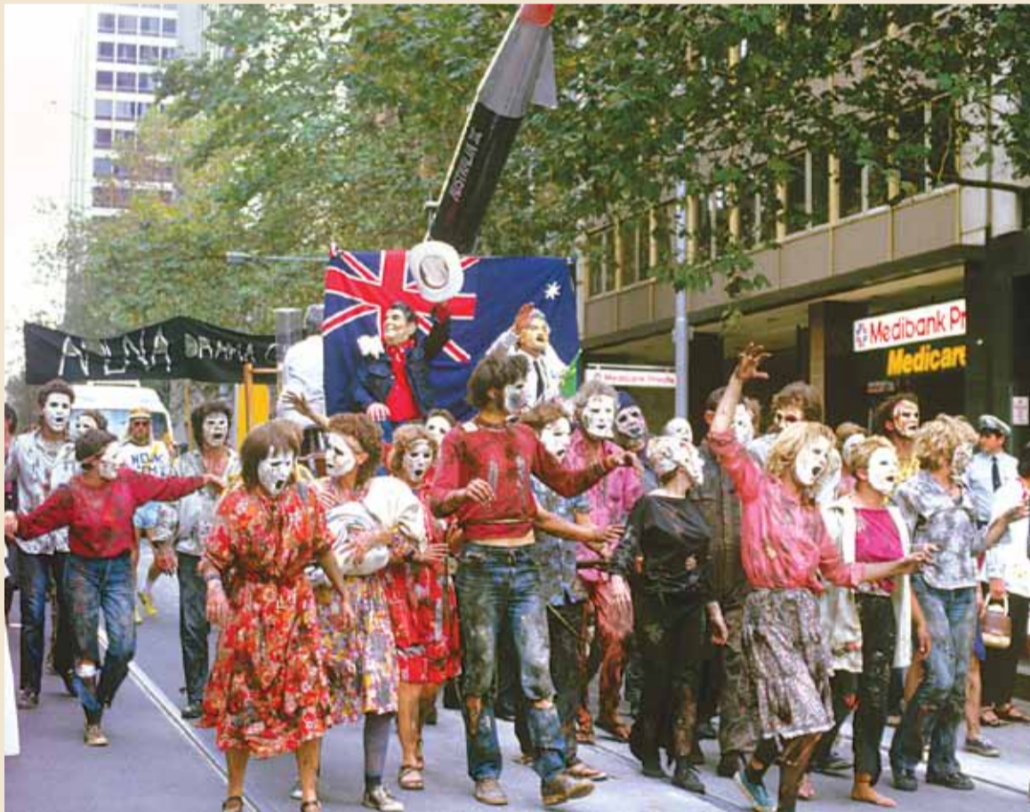
Anti-nuclear rally, Melbourne 1984. NAA: A6135, K26/6/84/20.