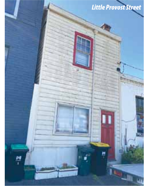
Little Provost Street