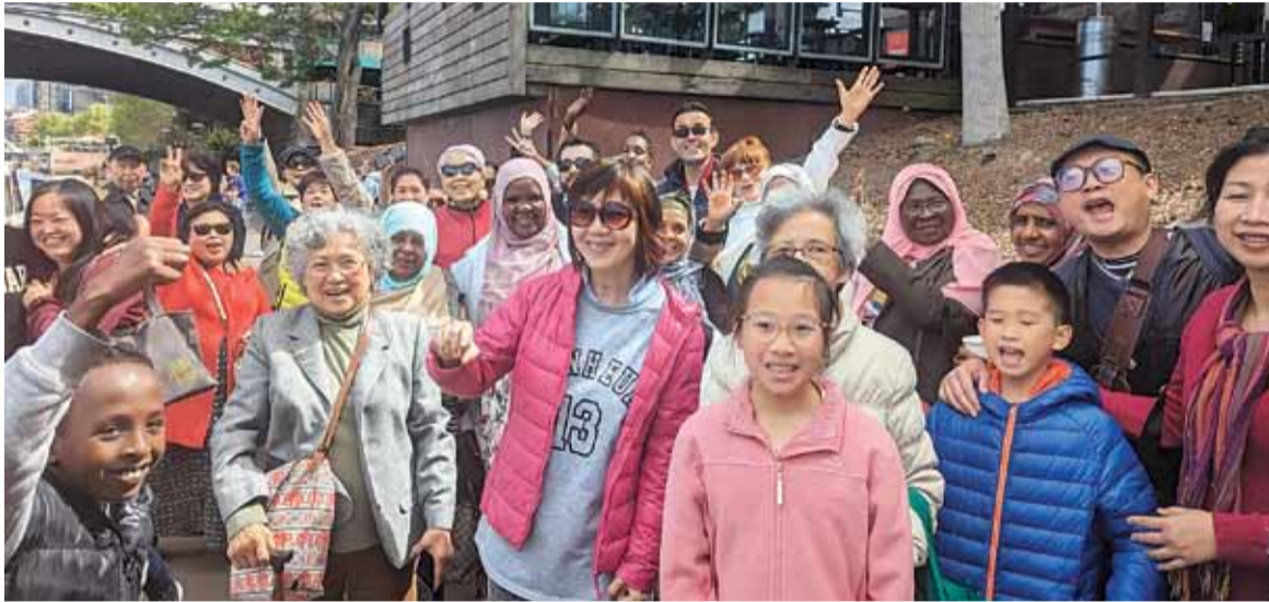
Happy sailors before boarding for the cruise.