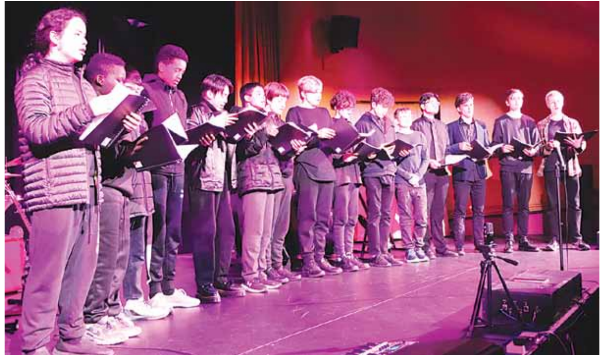
On stage at the Simonds Showcase: the vocal ensemble and rock band.