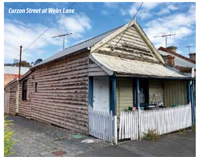
Curzon Street at Weirs Lane