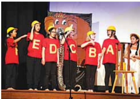
St Michael's students in performance.

The performance was part of St Michael's dedicated music program, in which all students participate in weekly music classes and have the